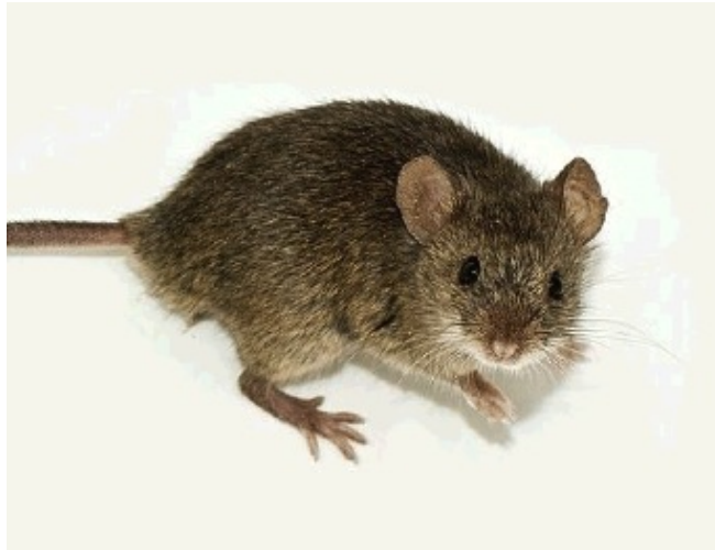
Figure S1: Picture of a mouse as presented in the instructions of the experiment.

Video: In the instructions subjects were informed about the process how mice are killed: “The mouse is gassed. The gas flows slowly into the hermetically sealed cage. The gas leads to breathing arrest. At the point at which the mouse is not visibly breathing anymore, it remains in the cage for another 10 minutes. It will then be removed.” They were also shown a short video: The mice first move vividly in the cage, then they successively slow down. Eventually they die, with their hearts beating visibly heavy and slow. For a publicly available demonstration video showing the gassing process of mice that is comparable to the one subjects saw, see (14).